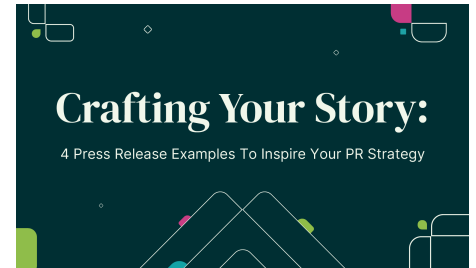
Crafting Your Story, 4 Press Release Examples To Inspire Your PR Strategy